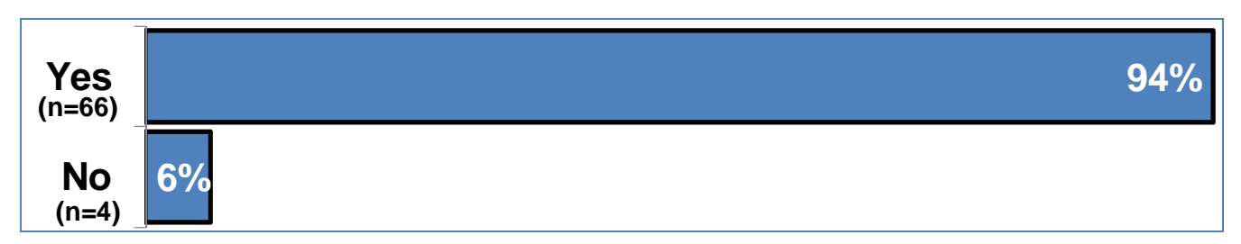
FIGURE 1 THE NEED FOR AN EMPLOYEE BEREAVEMENT SUPPORT PROGRAMME

Despite majority of the respondents receiving some sort of bereavement services as indicated above and 95% of the respondents benefiting from the support received, as indicated in Table 3, 66 (94%) of the respondents felt that there is definitely a need for an employee bereavement support programme at the institution and only 4 (6%) felt that there is no need for such a programme. These statistics correspond with the literature that a bereavement support programme in a workplace is necessary and can be extremely beneficial for employees (Dyer, 2002; Lev & McCorkle, 1998; Lynn, 2001; Pilgrims Hospice, 2008; Vincent, 2004).