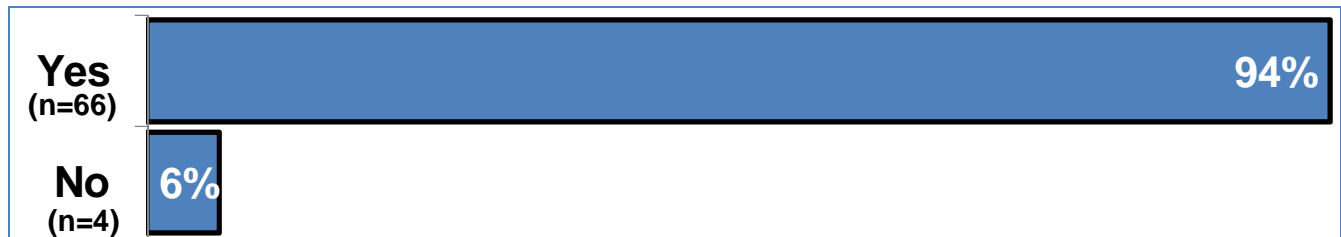
FIGURE 1 THE NEED FOR AN EMPLOYEE BEREAVEMENT SUPPORT PROGRAMME

Despite majority of the respondents receiving some sort of bereavement services as indicated above and 95% of the respondents benefiting from the support received, as indicated in Table 3, 66 (94%) of the respondents felt that there is definitely a need for an employee bereavement support programme at the institution and only 4 (6%) felt that there is no need for such a programme. These statistics correspond with the literature that a bereavement support programme in a workplace is necessary and can be extremely beneficial for employees (Dyer, 2002; Lev & McCorkle, 1998; Lynn, 2001; Pilgrims Hospice, 2008; Vincent, 2004).