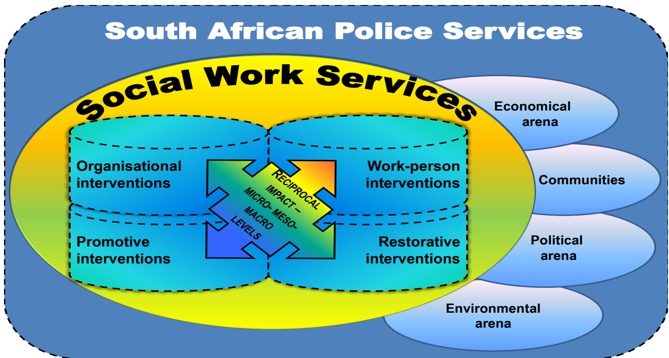
FIGURE 1 POLICE SOCIAL WORK PRACTICE MODEL